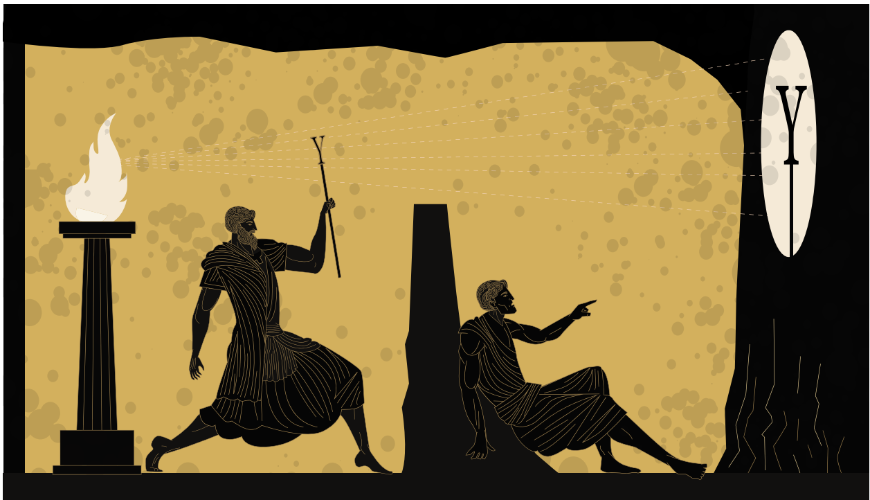
Fig. 2 Plato's cave: Successful takeover of reality by the sixth generation of warfare

For decades, Eastern Europe has been characterised by transformation processes and geopolitical dynamics that are significantly influenced by Russia’s actions. Following the collapse of the Soviet Union, Moscow has repeatedly attempted to regain its influence in the region – partly through diplomatic initiatives, partly through economic dependencies or even direct military interventions. Russia’s interference manifests itself in various forms, ranging from disinformation campaigns to support for separatist movements or populist parties. In the region, national sovereignty, Western ties, Europeanisation and Russian interests often compete in a delicate balance. From Russia’s perspective, for example, the aim is to weaken the key strategic region along its borders as a buffer zone to such an extent that, in the event of a conventional conflict with the EU or NATO, the technological and numerical inferiority can be compensated for by a previous disintegration of Eastern European societies. Ideally, however, the Kremlin hopes for success through psychological-cognitive THW, including the takeover of the political realities of the target countries, so that a physical conflict does not even have to occur. In the following, fictitious but possible and plausible scenarios up to 2030 are examined from the perspective of THW, which illustrate the possible future extent and mechanisms of Russian influence in Eastern Europe and their consequences for regional and European stability.